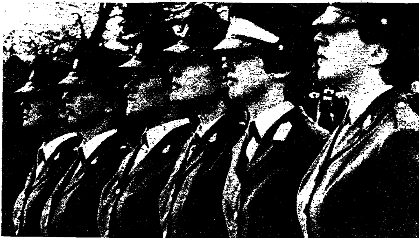
On parade: cadets of the Women's Royal Army Corps still face the prospect of compulsory retirement if they start a family

Inspecting the troops at a recent Sovereign's Parade at Sandhurst, the Queen asked why the new women officers were headed off into a corner while their male colleagues marched proudly round the parade square.